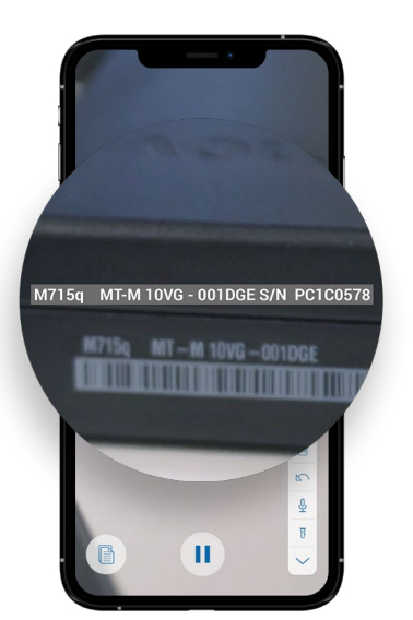
Figure 3: Using object character recognition (OCR), TeamViewer Assist AR converts a serial number into searchable text.

Figure 2: TeamViewer Assist AR support requesters see annotations and visual guides placed on their screen by the remote expert supporter, clarifying every step.