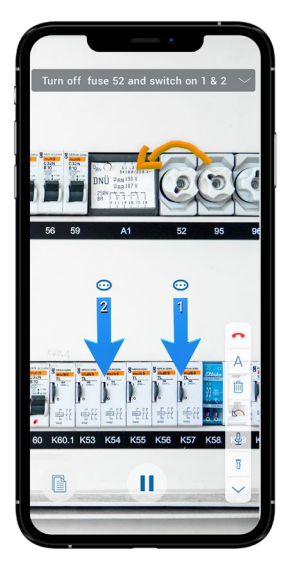
Figure 2: TeamViewer Assist AR support requesters see annotations and visual guides placed on their screen by the remote expert supporter, clarifying every step.

Guide users to perform common tasks they will have to perform routinely instead of doing the tasks for them.