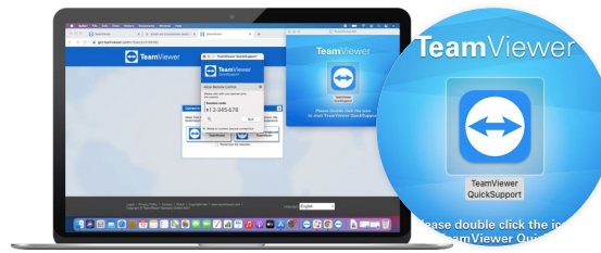
Figure 3: After opening the bookmark, the end user double clicks the TeamViewer icon to accept the support request.